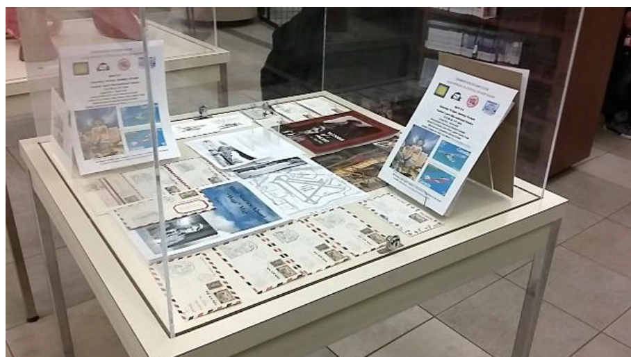
The ESC Spring Show 2016