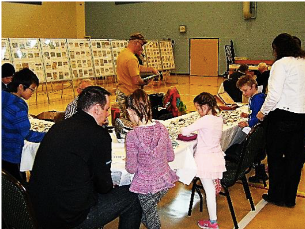
ESC Spring Show 2017